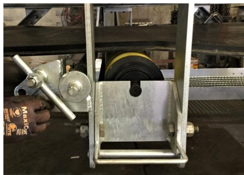
Belt in operational position; locking mechanism disengaged

7 Tahiti Lane Hillarys, WA 6025 (08) 9403 2993 www.handbmining.com.au