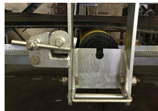
Belt lifted off belt; locking mechanism engaged